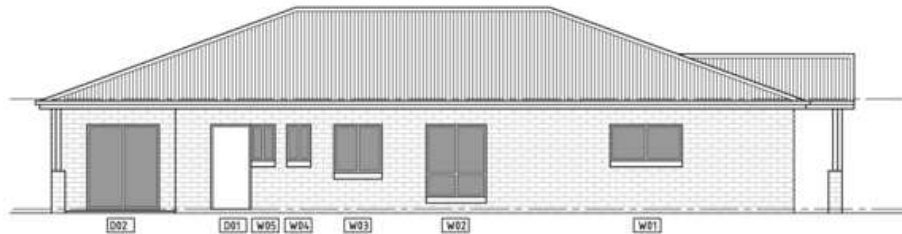
north elevation 1:100