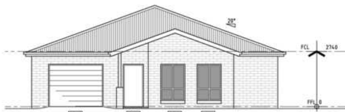
west elevation 1:100