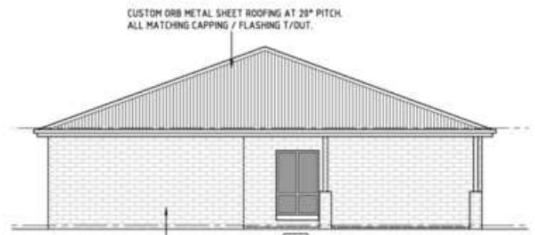
east elevation 1:100