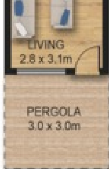
GRANNY FLAT 2